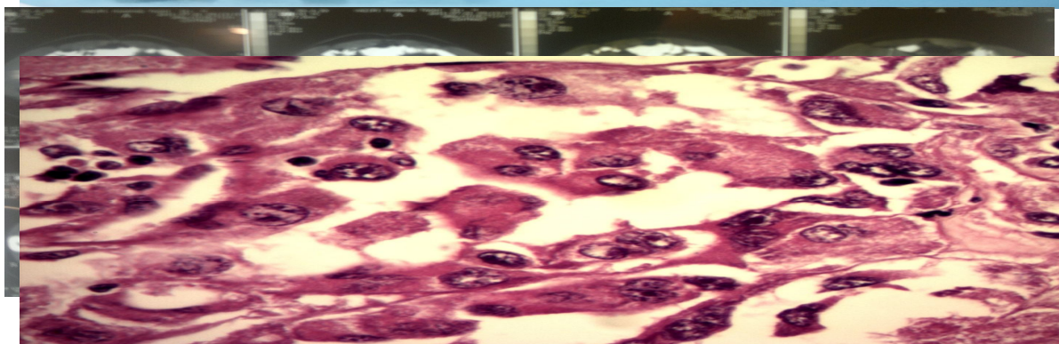
Figure 2: Coronal reformat images of abdominal & pelvic CT scan showed a retroperitoneal primary mass that was operated about 2 years ago