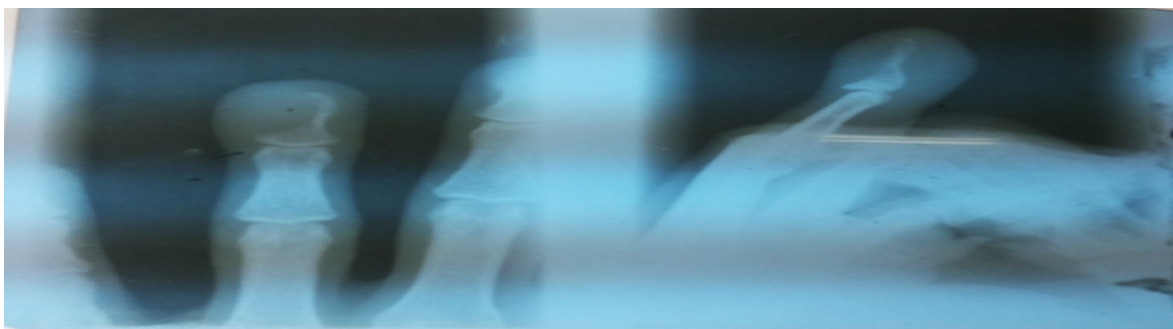
Figure 1: Osteolytic lesion of the distal phalanx: Plain radiographs of the right hand revealed a 1.2-cm osteolytic lesion involving the distal phalanx of the second digit

resection would yield the best chance of patient recovery and survival. Resection of the tumor was performed via laparotomy; a well-defined mass in retroperitoneal space without adhesion to urethra or other organs was transected and sent to pathology for further analysis. Histopathology report was obtained as a poorly differentiated (high grade) adenocarcinoma consistent with high grade RCC, which was incompatible with intraoperative and imaging data. There was no abnormality in either kidneys and no adhesion around the mass as it was observed during the operation. Therefore, we asked for a microscopic review and pathology, which confirmed that the lesion was ASPS. All surgical margins also were free [Fig. 3 & 4]. The patient refused adjuvant chemotherapy and unfortunately he did not show up to continue his treatment and further follow-ups.