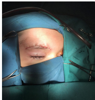
Figure 5: right eye after completion of surgery showing site of rod entrance and surgical approach