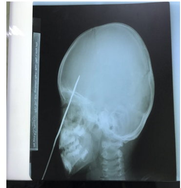
Figure 3: plain skull Xray(lateral view) denoting trajectory of metal rod