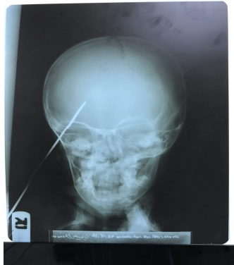
Figure 2: plain skull Xray (AP view) denoting trajectory of metal rod