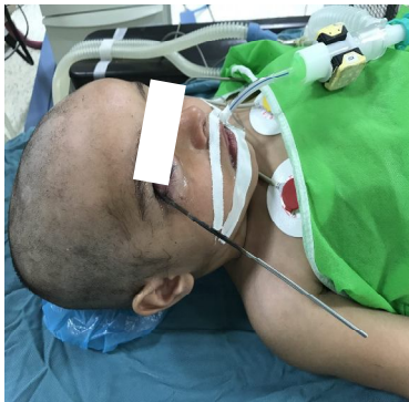
Figure 1: patient in the operating room after induction of anesthesia and before surgery

into the cranium, FB was removed and dura was repaired. Thereafter, another complete and delicate ophthalmologic investigation was done. Globe was intact and no injury to the lacrimal gland was detected. Finally, cranioplasty and repair of skin incision were carried out (figure5,6). The surgery took one hour and the patient was extubated. Spontaneous breathing was effective, and hemodynamic and gas exchange conditions were acceptable. The patient was transferred to the neurosurgery ward. No neurologic and ophthalmologic signs and symptoms were observed during hospitalization. Computed tomography (CT) of the brain for follow-up was normal. Ocular examination of the right eye 3 days after trauma was done and only mild lid edema was found. Visual acuity tests for this age were normal. Ocular motility was normal and alignment of the patient in primary position, upgaze and downgaze was normal. Anterior and posterior segment evaluation was normal. No pain or ocular discomfort was reported by the patient.