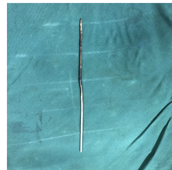
Figure 6: metal rod after removal