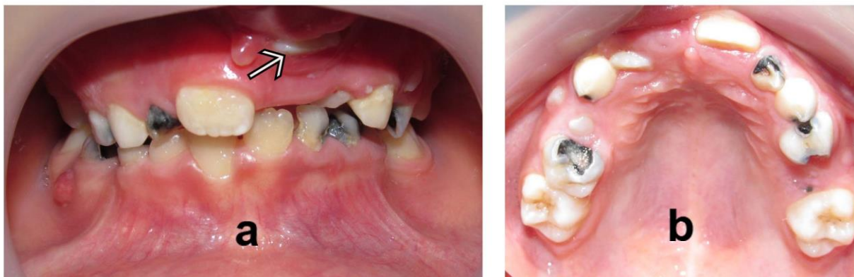
Figure 1: the pre- treatment intra- oral images, anterior view, the arrow points out the dilacerated tooth (a), occlusal view (b).

The patient was a six-year-old girl presented to the orthodontic clinic of Birjand dental school with her parents. The chief complaint was eruption of the left maxillary central incisor toward the lip (figure 1). The child had no history of traumatic injury. A panoramic view was ordered to evaluate the displaced tooth (figure 2). The radiography showed severe dilacerations at the cemento-enamel junction.