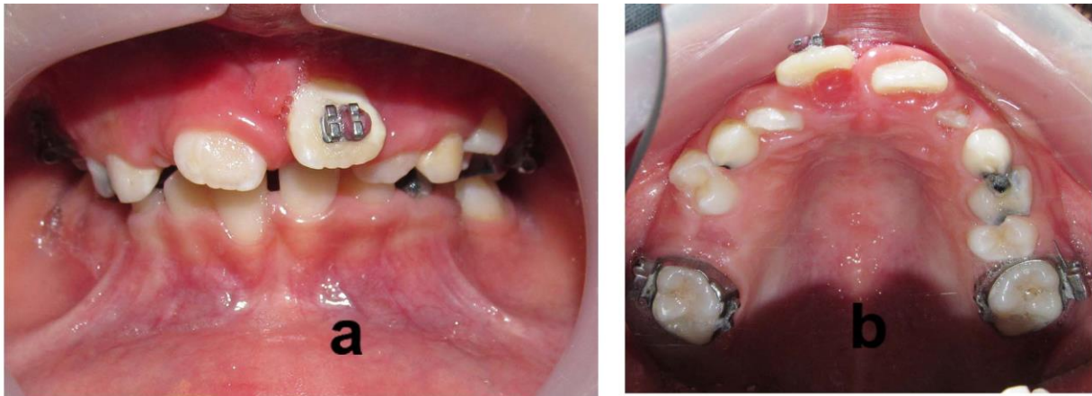
Figure 3: the post- treatment intra- oral images, anterior view, the eruption pass of the dilacerated tooth has been corrected(a), occlusal view (b).

The eruption path of the dilacerated tooth (upper left central incisor) was corrected within five months (figure 3). A post treatment panoramic was taken which revealed the correction of the eruptive path though the dilacerations still was evident (figure 4).