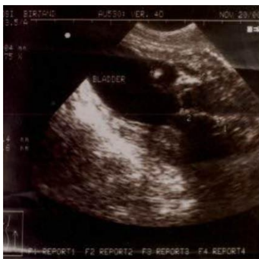
Figure 1: Ultrasound; an echogenic curved mass with obvious posterior shadow

history of the self-inserted foreign body.