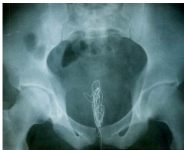
Figure 2: Kidney, ureter, and bladder (KUB) X-ray; a long metallic density superior to the pubic symphysis

therefore, it could be grasped in the prostatic urethra through the bladder and removed. The wire was 110 cm in length. The bladder was repaired in two layers, and the wound was closed. The patient was catheterized for a week after the operation, and upon its removal the patient had no problem. After a month, the case was reported with no symptom, and urine analysis was normal.