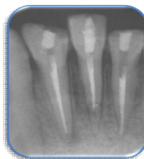
Figure 3: follow up radiography (1 year)