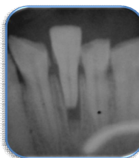
Figure 1: Initial radiography

The splint was opened after 50 days. Radiographic evidence revealed the healing of the bone lesion and binding the fragments in adjacent fracture line. One-year radiographic follow up showed complete healing of bone lesion, close contact between the broken fragments, the connection between dental parts and the formation of hard tissue between the two fragments (Figure 3).