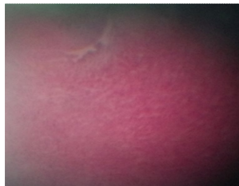
Figure 3: Microscopic view of aortic thrombosis