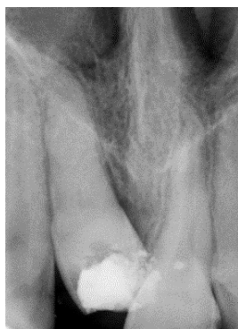
Figure 3: Root canal filled with densely packed calcium hydroxide

position (8). Once filled, the canal radiographically appeared to be calcified because the radiodensity of calcium hydroxide in the canal is usually similar to that of the surrounding dentine (Figure 3). The root canal dressing was checked every 3 months accompanied by the assessment of calcium hydroxide washout.