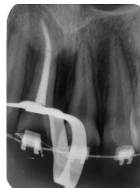
Figure 4: Radiograph during root canal obturation

An orthodontic force was applied in order to re-erupt the tooth. The tooth was then actively orthodontically extruded. The patient was called again for control, and the condition of the right maxillary central was assessed. After 5 months, the tooth erupted in the right position and it was decided to obturate the root canal. Thereafter, calcium hydroxide was removed gently. The canal was flushed, dried, and filled with gutta-percha (Ariadent, Iran) and sealer (AH Plus, Dentsply De Trey GmbH, Germany) with lateral compaction technique (Figure 4) and restored with a light-cured resin composite (GC America, Alsip, IL, USA). It was decided to plan for clinical and radiographic controls of the treatment condition at 3, 6, and 12 months and yearly at least for 5 years. In a 30-month follow-up, the tooth had remained functional and esthetically acceptable. Moreover, the percussion sound and mobility were observed