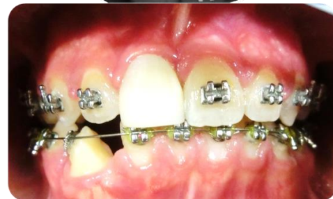
Figure 5: Intra-oral and radiographic images after 30-month follow-up