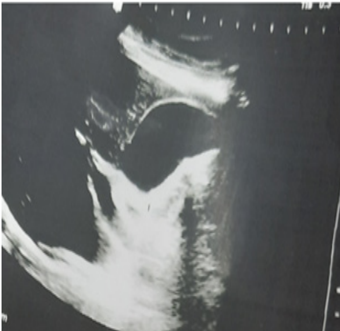
Figure 3. In the performed ultrasonography, the image of the mixed echo area containing solid and cystic areas can be seen in the upper bridge of the left kidney with dimensions of 26 x 37 mm.

Seborrheic was recommended for follow-up. The patient was referred to an oncologist for further examination of the kidney and was monitored during this period. The patient's left kidney cyst was reported to be simple; no medication was prescribed for the patient; and during this period, follow-up and outpatient referral were recommended.