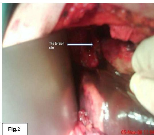
Figure 2: Torsion site is shown here

A 67-year-old man was admitted to the emergency ward with a right upper quadrant and epigastrium pain with nausea and vomiting, which have been suddenly initiated 8 hours prior to the