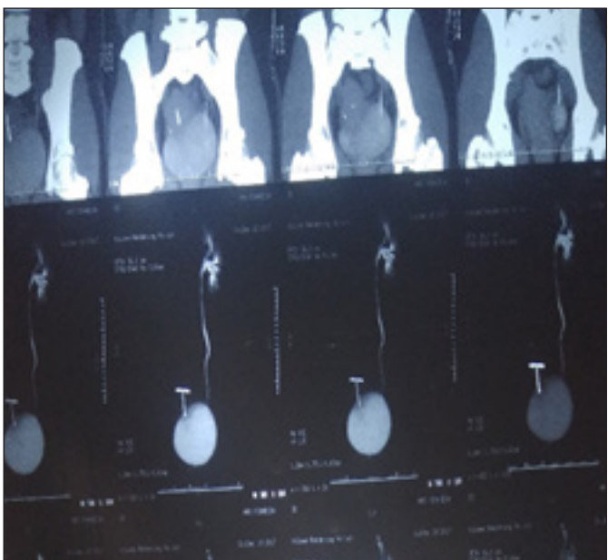
Figure 3. Migrated IUCD with no excretion of contrast from right kidney