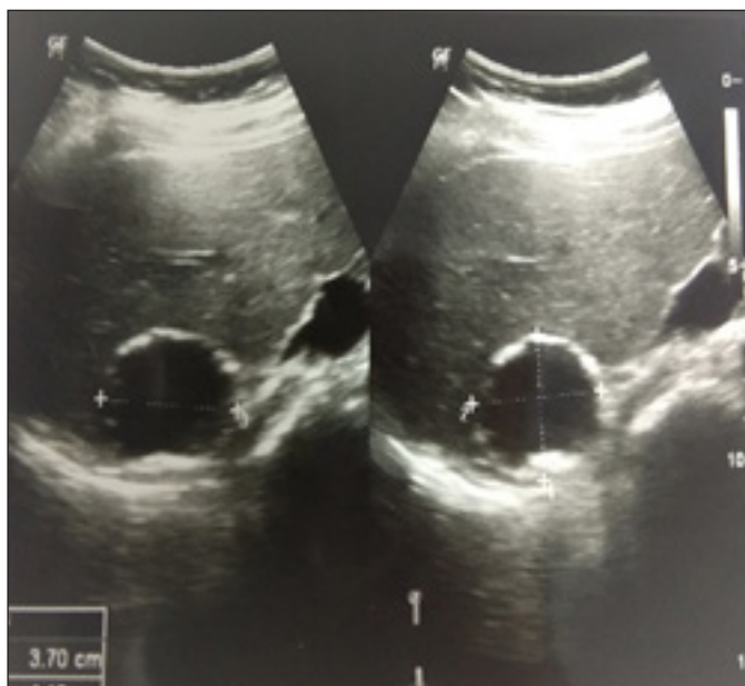
Figure 1. Right Grade IV Hydronephrosis.