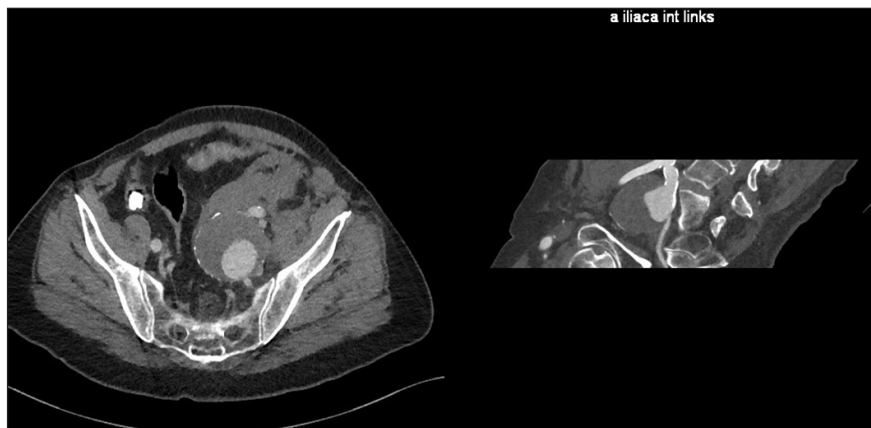
Figure A. Rupture of the IIAA with the associated retroperitoneal hematoma (both transversal and longitudinal coupe)

wish to attempt the endovascular treatment via a minimal approach, an embolization procedure was performed by the intervention radiologist. Digital subtraction angiography (DSA) confirmed the CTA findings and showed the IIA aneurysm without active contrast extravasation (Figure B). Using an 8-French sheath, two side branches of the internal iliac artery were embolized with a Glidecath Cobra catheter and 6 mm and 7 mm coils. The systolic blood pressure dropped during the procedure to 80-90 mmHg, after transfusion of one packed cell the blood pressure remained stable around 100-110 mmHg systolic. The procedure was continued and two Interlock coils were placed in the IIAA, the proximal internal iliac artery was embolized using a 16 mm Amplatzer plug. Repeat DSA showed a successful embolization of the IIAA (Figure C).