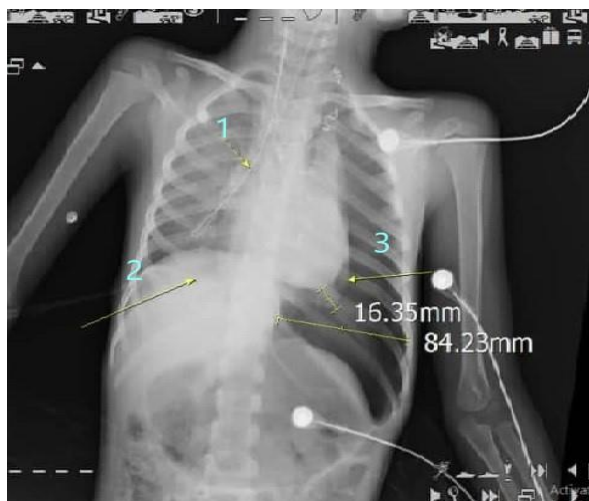
Figure 1. (1) Central venous line; (2) pigtail catheter; (3) Pneumothorax size (16.35 mm is the width of lung and 84.23 mm is the width of pneumothorax)

The patient's blood pressure was successfully restored. Subsequently, an echocardiogram, including views of the pericardial and pleural spaces, was carried out. A pigtail catheter was inserted into the right pleural space, resulting in the drainage of approximately 500 cc of dark blood. A portable chest X-ray was then obtained, which revealed a left-sided tension pneumothorax. A size 16 French chest tube was inserted into the left pleural space, resulting in the drainage of approximately 100 mL of blood and air (Figures 1-3). One unit of packed red blood cells was transfused (approximately six ampules of epinephrine were injected during CPR). Due to the cessation of further drainage and the maintenance of acceptable blood pressure, the patient was transferred to the ICU for treatment of metabolic acidosis and anemia. On the same day, the patient was extubated and subsequently underwent the Fontan procedure 10 days post-operatively.