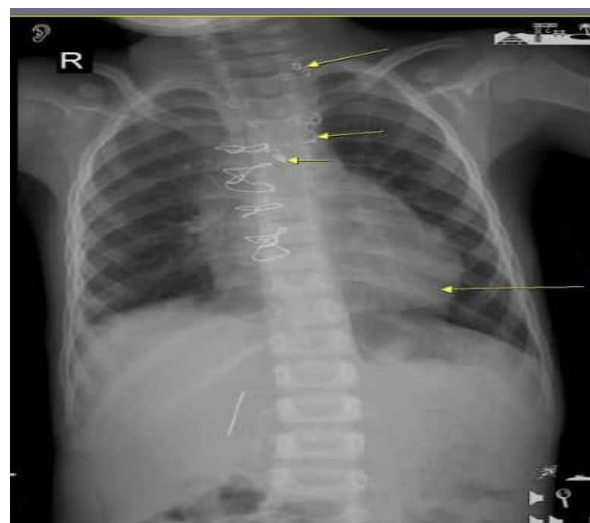
Figure 3. Position of the lung improved after performing the Fontan procedure