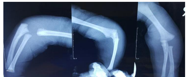
Figure 1. Anteroposterior and Lateral Radiographs at 9 Days Showing Posteromedial Radio-Ulnar Displacement

A 9-day-old term neonate, born via uncomplicated vaginal delivery, presented with restricted movement of the right upper limb. Although discharged without issues per medical records, the parents reported symptom onset from birth. Examination revealed elbow swelling, tenderness, and reduced ROM, with intact neurovascular status and a preserved posterior elbow triangle. Laboratory tests showed no infection. Anteroposterior (AP) and lateral radiographs (Figure 1) demonstrated posteromedial displacement of the radio-ulnar complex, consistent with a Salter-Harris type I distal humerus physeal separation. Due to delayed presentation, closed reduction was not attempted, and the elbow was immobilized with a splint. One week later, radiographs showed early callus formation (Figure 2). At follow-up three weeks later, the patient's splint was removed. The patient was revisited 50 days later, with radiographs indicating healing (Figure 3) and near-normal ROM despite mild varus (Figure 4).