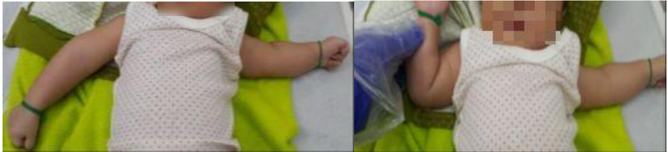
Figure 4. Range of Motion at 60 Days with Mild Varus of right elbow

with normal ROM (Figure 5) and radiographic evidence of complete remodeling (Figure 6), without physal bar formation or deformity. Over the past four years, the patient has been able to perform daily activities without issues and has not required specific medical care. Notably, the mother later disclosed an unintentional injury by the father, not birth trauma, explaining the delayed referral. Informed consent was obtained for this report.