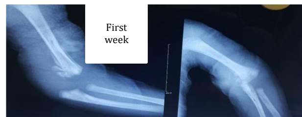
Figure 2. Radiographs at 16 Days after birth with Early Callus Formation (one week after trauma)