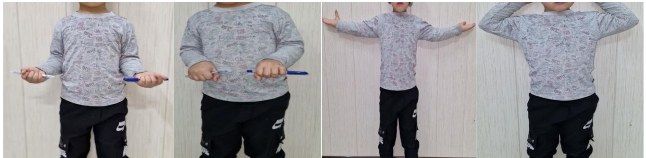
Figure 5. Normal Range of Motion at 4 Years