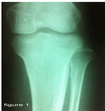
Figure 1: Simple radiography of knee with no finding of Ewing's sarcoma

Open incisional biopsy of upper tibial metaphysis was performed and the histopathological diagnosis was Ewing's sarcoma as confirmed by IHC (immunohistochemistry). After some course of chemotherapy and radiotherapy, diplopia was improved.