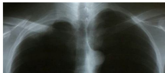
Figure 4: A prominent homogenous opaque shadow in the right apical region