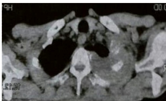
Figure 6: Axial CT image shows a homogenous lung mass in the right apical region destroyed the adjacent ribs

The patient did not have any respiratory symptoms and Horner's syndrome at the time of diagnosis. He just complained of asthenia and 6 kg weight loss in the last 6 months. A tissue diagnosis of the tumor via CT guided FNA showed bronchogenic adenocarcinoma, and the pain was decreased significantly after chemotherapy.