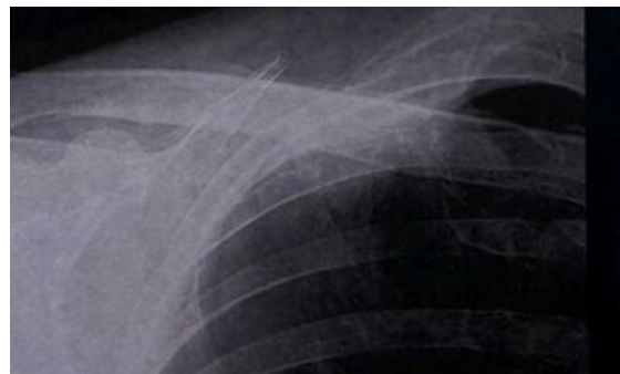
Figure 3: A doubtful homogenous opaque shadow near the right second rib