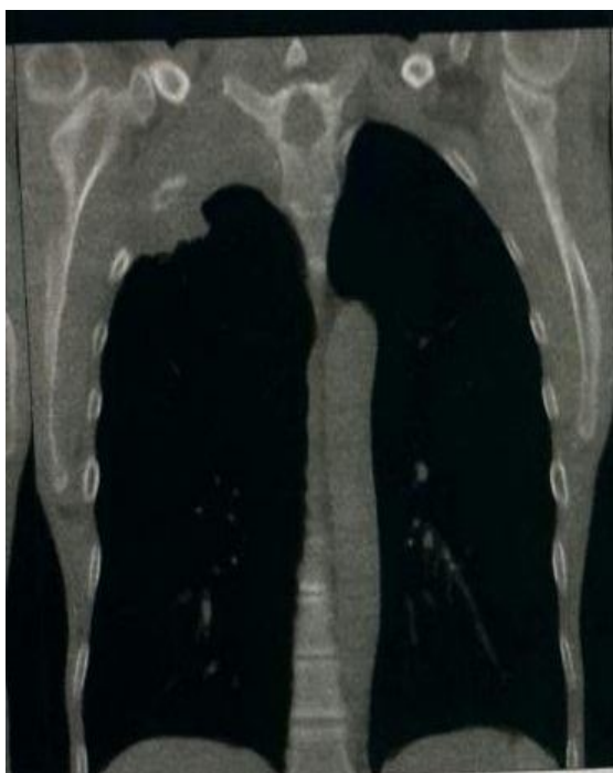
Figure 5: Coronal reformatted CT image shows the right apical tumor invading the chest wall and first and second ribs