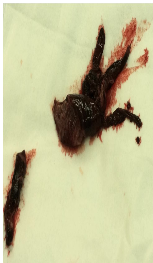
Figure 3: Fresh clot of LPA and superior branch of RPA

The patient underwent pulmonary embolectomy after replacement of IVC filter (Fig. 3). She was discharged from hospital 10 days after the operation in a good general condition and she is alive at 2-year follow-up.