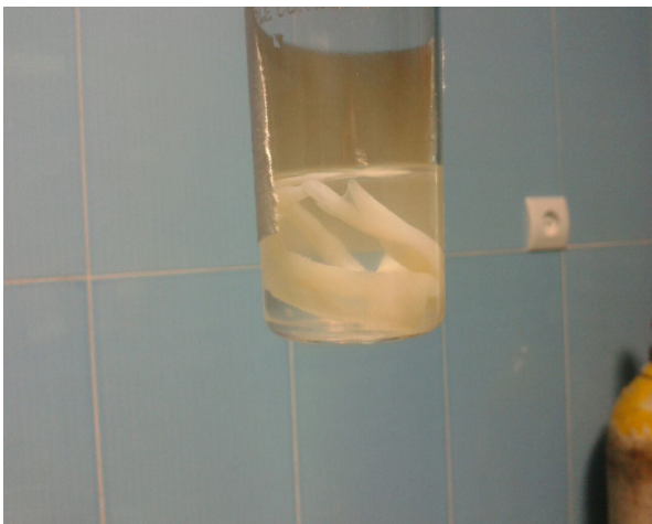
Figure 2- Hydatid cyst excised from the patient's shoulder