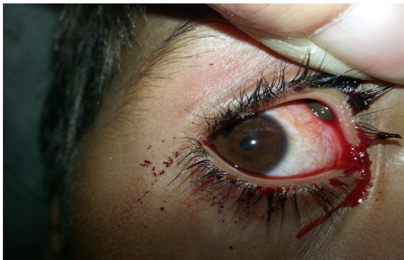
Figure 1: Bloody tear and hidden leech at superior fornix

understood that the globe was intact and the anterior chamber, pupil, lens, and anterior vitreous examination were in normal range. In fact, this foreign body was an alive leech attached to limbus while sucking blood from the bulbar conjunctiva. Meticulous history of this child revealed that after trauma, he started to bleed from the wound of his left eye. Then he went to wash his face in stream water, where the leech attached to his eye. Similar to the previous case, after instillation of lidocaine eye drop to inferior fornix, the leech was grasped with a tying forceps and removed from the eye. The day after, there was no bleeding and ocular symptoms.