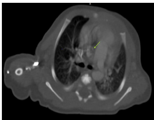
Figure 2: CT angiography with contrast confirmed the aortic mass.

Arterial Blood Gas 1 , Total bilirubinemia 2 , direct Coombs test 3 , Cell Blood Count 4 : (white blood cells: WBC; hemoglobin: Hb; hematocrit: Hct; platelets: plt), liver enzyme level 5 : prothrombin activity and activated partial thromboplastin time 6 , blood culture 7 , Serum alpha phytoprotein 8 , Anti-Rho=lupus anticoagulant 9 , TORCH study 10 (toxoplasmosis, cytomegalovirus and rubella)