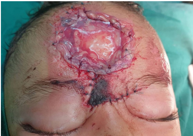
Figure 3. Utilization of amniotic membrane for severe soft tissue reconstruction in the forehead area