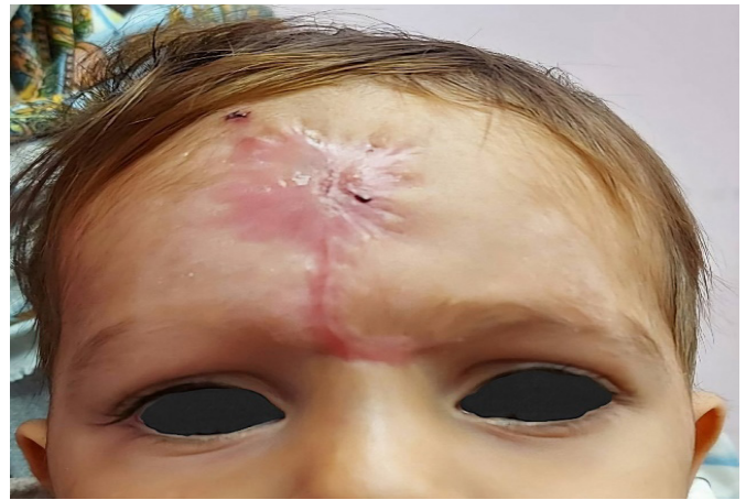
Figure 4. Six months post-reconstruction of the area