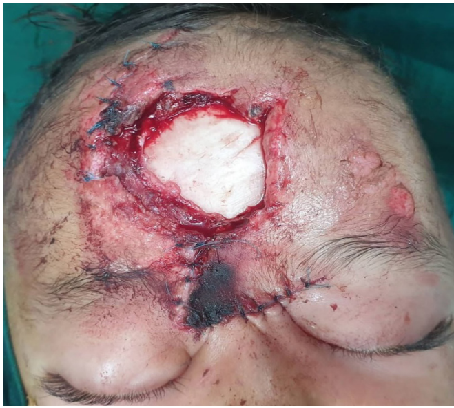
Figure 1. Patient's forehead Injury

emergency department of Zahedan Khatam-al-Anbia Hospital in 1402 (IR.ZAUMS.REC.1402.356).