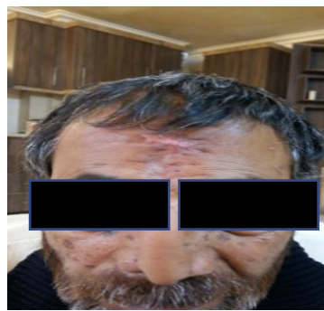
Figure 2: Removed lesion (postoperative)

and gender (3, 5). Except for age, all factors were present in our case. Although SCC is the second most common skin cancer after BCC, it is aggressive and has metastasis capability. Due to this feature, timely diagnosis can prevent the occurrence of metastasis (6). In the case presented, cancer was diagnosed early and had no metastasis. Moreover, in our case, no metastasis was found according to the results obtained from the examination of neck lymph nodes and computed tomography scan (7). There are some treatments for SCC, including radiotherapy, topical chemotherapy, systemic chemotherapy, and surgery (8). In our case, the surgical treatment and radiotherapy were performed due to the results of examination and dimensions of the lesion.