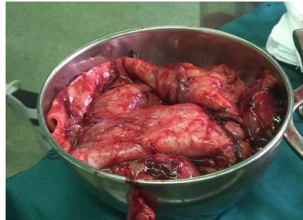
Figure 2: Complete dissection of the kidney from the body

divided using multiple clips. The specimen was extracted using entrapment sac. The surgical management ended without any complication.