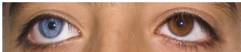
Figure 1: Heterochromia