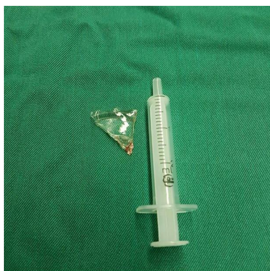
Figure 2: Removed foreign body

Although flexible endoscopy which is a cost-effective treatment does not require general and local anesthesia to remove objects, it has a limited impact if the object is too sharp or keen. Since the rigid endoscopy provides a wide-open space, it is regarded as a great advantage to remove sharp and keen foreign bodies from the esophagus. Moreover, it is also possible to utilize a variety of different tools by this method in