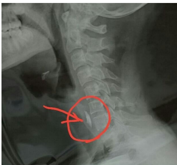
Figure 1: Neck and chest X-ray of the foreign body

radiography image was taken showing the aspirated piece of glass with high density in the area.