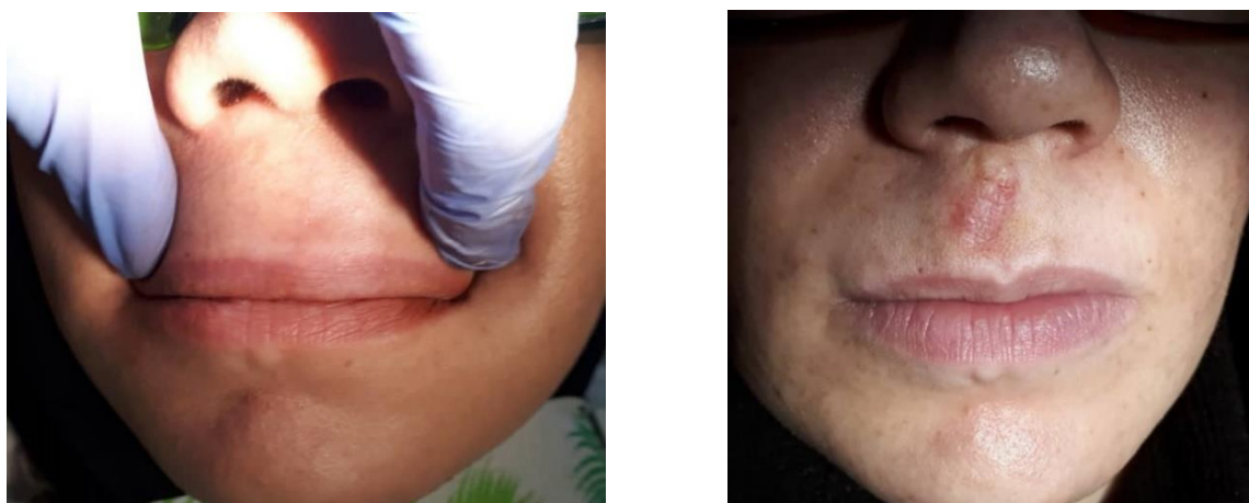
Figure 2: A) Lesion state right after laser therapy of hemangioma, B) one week after lesion removal

Department of Oral Medicine of Semnan Dental School, Located in Semnan, Iran, for a dental checkup. She had a swelling on the top of her upper lip. This lesion had existed since birth and had grown until 5 years of age, but then had shrunk in size and remained stable. The patient had referred to many dentists, and they all had denied the possibility of getting rid of the lesion (Figure 1). Clinically, the swelling had the same color as the adjacent skin, with a smooth and lobulated surface. In the extraoral examination, it measured 2×1.5 cm and was located on the right side of the upper philtrum, from the vermilion border up to the bottom of the nose. In addition, magnetic resonance angiography displayed a 1-cm lesion which was located deep on the back of the upper lip. After obtaining informed consent, the diode 940 laser was used to achieve coagulation in the lesion. The lesion disappeared just in a few seconds without any pain, bleeding, or discomfort. Subsequently, the extra, loose, superficial skin was removed by a blade (Figure 2). The recovery process was observed in three follow-up sessions