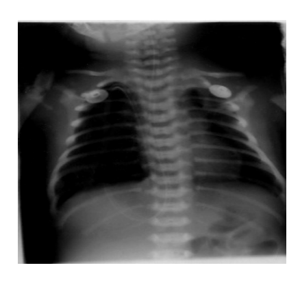
Figure 1: chest and abdomen X-ray showing the nasogastric tube

Nasogastric tube was observed in the first intercostal space, which indicated the atresia of esophagus. (Figure 1). Thus, the infant was sent to more specialized department. In the assessment carried out in the first 48 hours, all laboratory tests were in normal range.