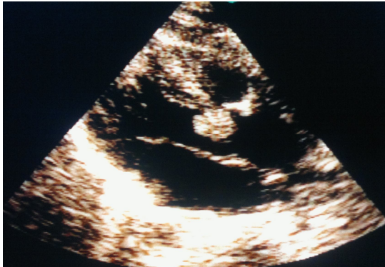
Figure 1: LVOT Tumor in LAX 2D echocardiography about (size=11x12mm)

The functional diameter of the outflow tract was about 11×12 mm (fig 3) and the pressure gradient reached 55mmHg.