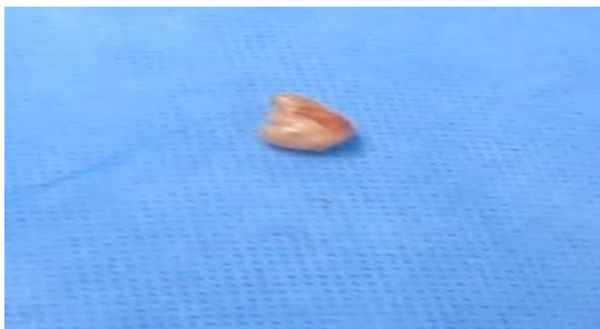
Figure 3: Resected tumor in size about 12*11mm. Macroscopy view of tumor (rhabdomyoma)

Despite of having severe LVOT, obstruction and left ventricular hypertrophy, the infant in this case did not show signs of hemodynamic compromise.