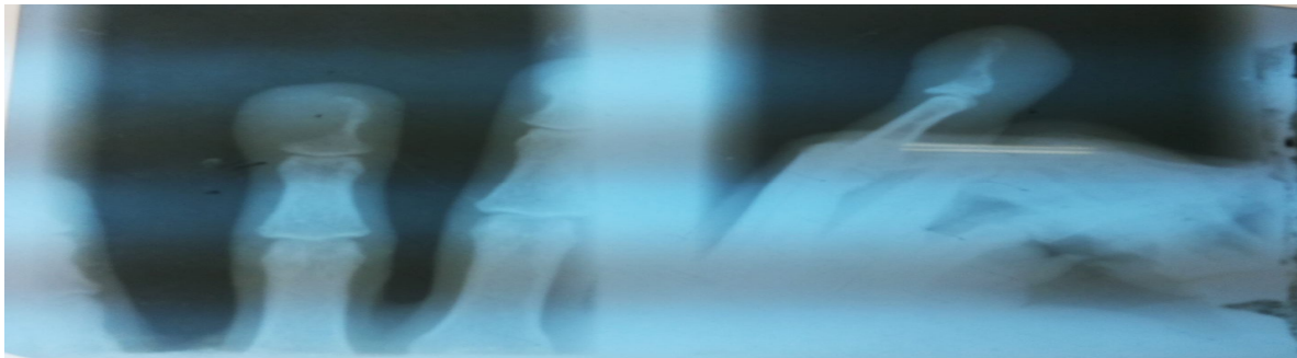
Figure 1: Osteolytic lesion of the distal phalanx: Plain radiographs of the right hand revealed a 1.2-cm osteolytic lesion involving the distal phalanx of the second digit

resection would yield the best chance of patient recovery and survival. Resection of the tumor was performed via laparotomy; a well-defined mass in retroperitoneal space without adhesion to urethra or other organs was transected and sent to pathology for further analysis. Histopathology report was obtained as a poorly differentiated (high grade) adenocarcinoma consistent with high grade RCC, which was incompatible with intraoperative and imaging data. There was no abnormality in either kidneys and no adhesion around the mass as it was observed during the operation. Therefore, we asked for a microscopic review and pathology, which confirmed that the lesion was ASPS. All surgical margins also were free [Fig. 3 & 4]. The patient refused adjuvant chemotherapy and unfortunately he did not show up to continue his treatment and further follow-ups.