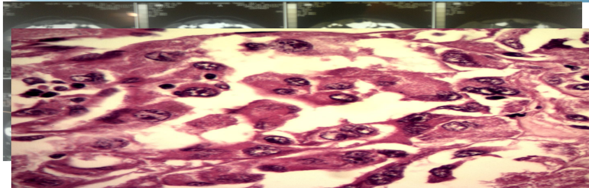
Figure 2: Coronal reformat images of abdominal & pelvic CT scan showed a retroperitoneal primary mass that was operated about 2 years ago