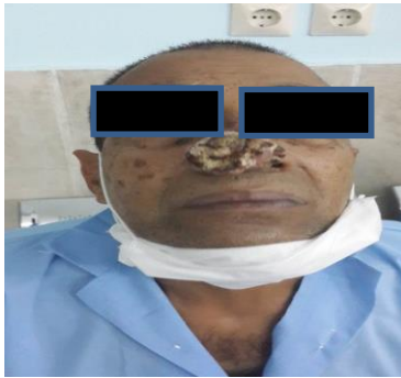
Figure 1: A large Squamous Cell Carcinoma on the nose (preoperative)