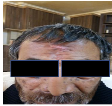
Figure 2: Removed lesion (postoperative)

and gender (3, 5). Except for age, all factors were present in our case. Although SCC is the second most common skin cancer after BCC, it is aggressive and has metastasis capability. Due to this feature, timely diagnosis can prevent the occurrence of metastasis (6). In the case presented, cancer was diagnosed early and had no metastasis. Moreover, in our case, no metastasis was found according to the results obtained from the examination of neck lymph nodes and computed tomography scan (7). There are some treatments for SCC, including radiotherapy, topical chemotherapy, systemic chemotherapy, and surgery (8). In our case, the surgical treatment and radiotherapy were performed due to the results of examination and dimensions of the lesion.