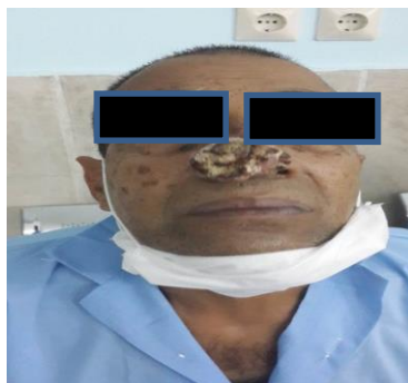
Figure 1: A large Squamous Cell Carcinoma on the nose (preoperative)