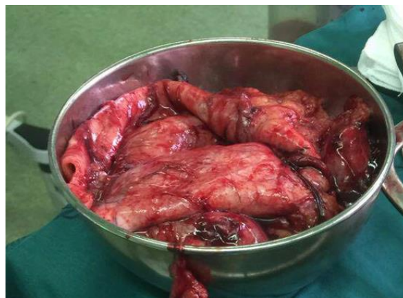
Figure 2: Complete dissection of the kidney from the body

divided using multiple clips. The specimen was extracted using entrapment sac. The surgical management ended without any complication.