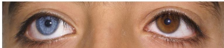
Figure 1: Heterochromia