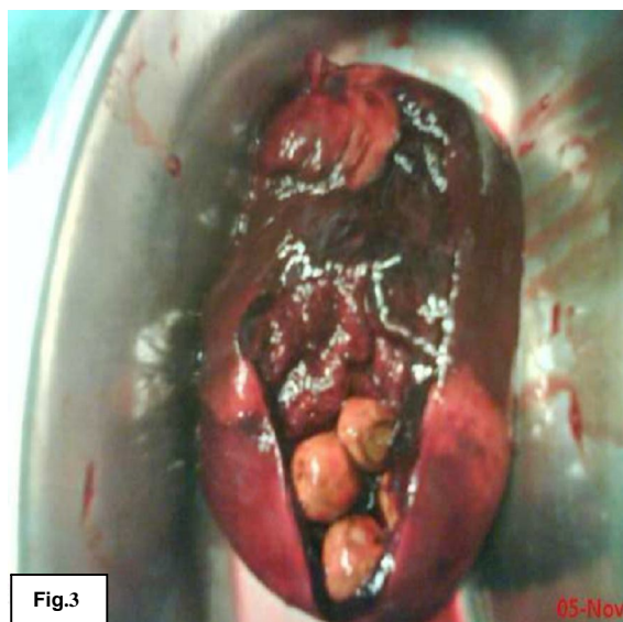
Figure 3: Gall stones inside the excised and opened up gallbladder

time. With the exception of tenderness in epigastrium and RUQ, other physical findings were normal. A leukocyte count of 12000/mm 3 (PMN 94%), and normal serum total and direct bilirubin were his lab test results. The abdominal plain radiographies were normal. Ultrasound examination showed a large distended gallbladder with thickened wall (7mm) without any stones inside. Assuming acute cholecystitis as the diagnosis, intravenous fluid, broad spectrum antibiotics and analgesic were started. Because of the severe tenderness in his RUQ the patient underwent through an emergent laparotomy. The gallbladder has been rotated 180 degrees clockwise; therefore, after the detortion, it was excised. The patient was discharged 5 days after the surgery. The pathology report showed a transmural gangrene of the gallbladder.