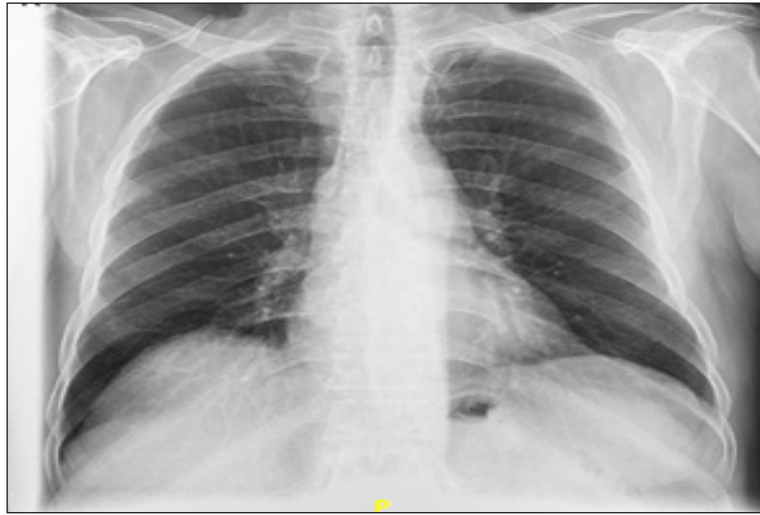
Figure 1. Chest X-ray (CXR) with normal cardiothoracic ratio (CTR), open costophrenic angle, and no consolidation.